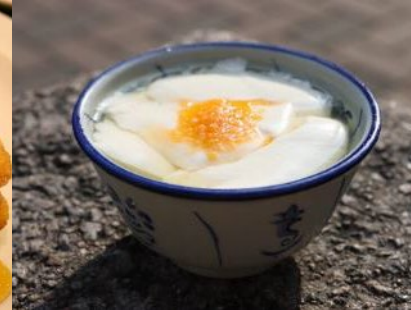
Tofu pudding / steamed milk