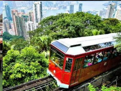
Victoria Peak (Peak tram)