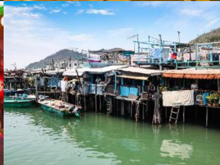
Tai O Fishing Village