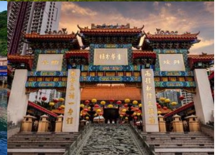
Wong Tai Sin Temple