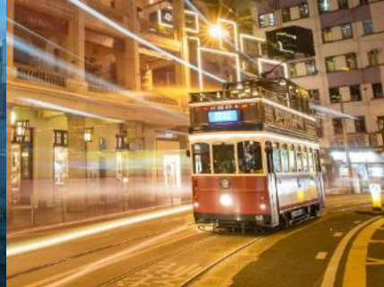
Hong Kong Trams (Ding-Dings)