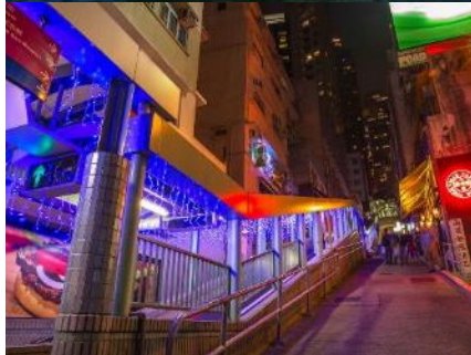
Central to Mid-Levels Escalator