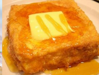
Hong Kong French toast