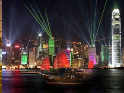
A Symphony of Lights