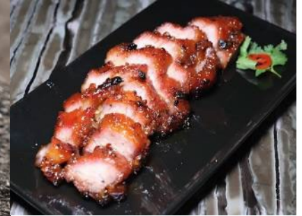
Char Siu (BBQ pork)